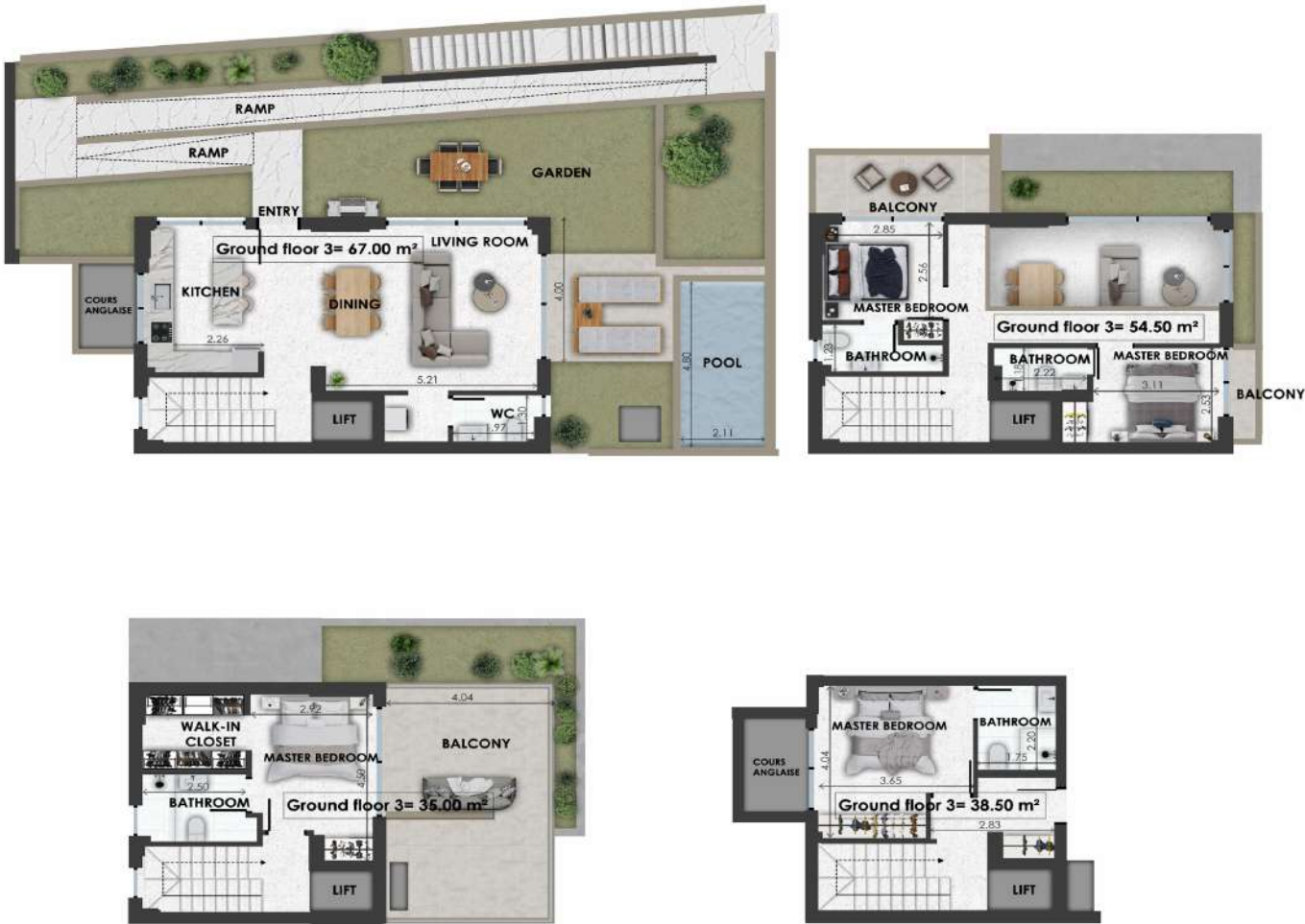
OPEN SKY Project