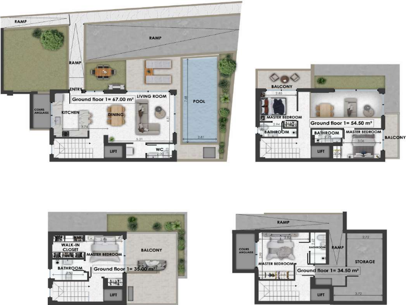
OPEN SKY Project